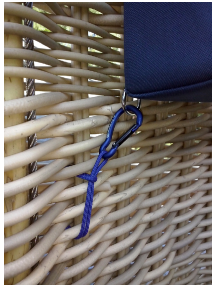
Cord Loop Detail