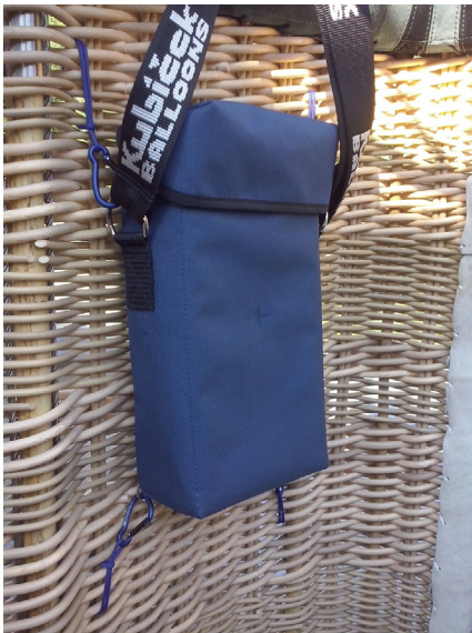
Installation of Storage Bag to Basket Wall

Store the accumulator in the bag, and put the light with the cable on top. Attach the cable loop carabiner to a nearby rope handle. The cable must be free of knots and entanglement so that the lights can be easily dropped down from the basket.